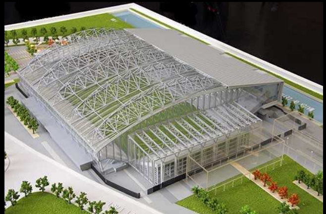
Image showing the proposed Otago Stadium (above) Lighting helps illuminate the model and add to the design (below)

The model was on public display at the Dunedin Art Gallery before being used at council meetings and a road show around the Otago Region.